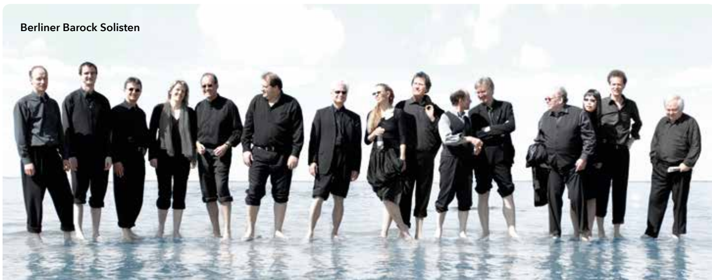
Berliner Barock Solisten

6.00 First Part Concerto in D major, BWV 1054 Concerto in D minor, BWV 1052 7.00 Interval 7.20 Second Part Concerto in A major, BWV 1055 Concerto in E major, BWV 1053 Concerto in F minor, BWV 1056 End at 8.20pm