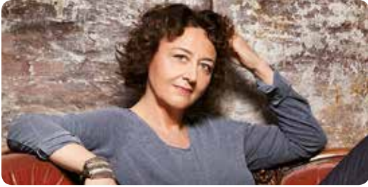
NATHALIE STUTZMANN &amp; ORFEO 55

Nathalie Stutzmann is considered as one of the most outstanding musical personalities of our time, with parallel careers as both Contralto and Conductor. Her charismatic musicianship, the unique combination of rigor and fantasy which characterizes her style has been recognized by her peers, audience and critics alike. She founded the ensemble Orfeo 55 in 2009, and their new album of Italian arias, "Quella Fiamma", has been released recently under Warner/Erato. Other recordings are: Prima Donna (2011), a collection of Vivaldi's arias for contralto, and Une Cantate imaginaire, which celebrates Bach with a selection of his most notable arias, released under the Deutsche Grammophon label, and Heroes from the shadows, arias written for Handel's secondary operatic characters, released under Warner/Erato. All of them received critical acclaim and awards such as Diapason d'Or, Melómano de Oro and Editor's Choice in Gramophone. From September 2018, she will be Chief Conductor of Kristiansand Symphony Orchestra in Norway. She is also Principal Guest Conductor of RTÉ National Symphony Orchestra of Ireland and Associate Artist of the Sao Paulo State Symphony Orchestra.