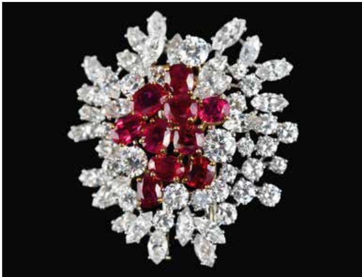
Chaumet. Ruby and diamond brooch pendant. Sold: CHF 40,000 Chinese porcelain jardinières, probably end of the Qing dynasty. Sold: CHF 33,000