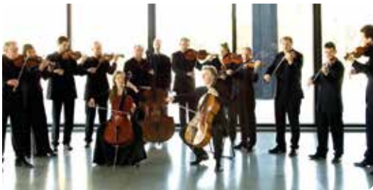
BERLINER BAROCK SOLISTEN

Few ensembles display a level of artistic mastery akin to that of the Berliner Barock Solisten, founded in 1995 by Rainer Kussmaul and other prominent members of the Berlin Philharmonic. These musicians have joined their talents in creating a unique approach to the musical works of the 1600's and 1700's and to "transfer" compositions from ages long past into our day and age, without damaging the historical veneer that covers them. A style that spans the ages, fully valid both then and now. Baroque soloists from Berlin, each one of them a true bravura player, show remarkable flexibility, allowing them to play on old instruments. Combined with the ensemble's exceptional homogeneity and the presence of leading early music soloists, have contributed towards establishing this group's leading position on the international scene.