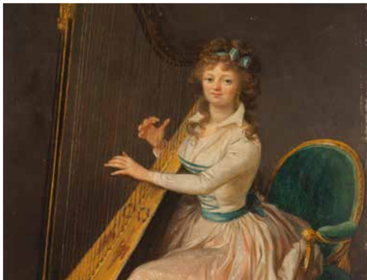
Marguerite Gérard (1761-1837), The Harp player. Sold: CHF 19,000 Patek Philippe. Platinum chronograph watch. Ref. 5970P-001. Sold: CHF 194,000