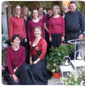
Choeur de Poche